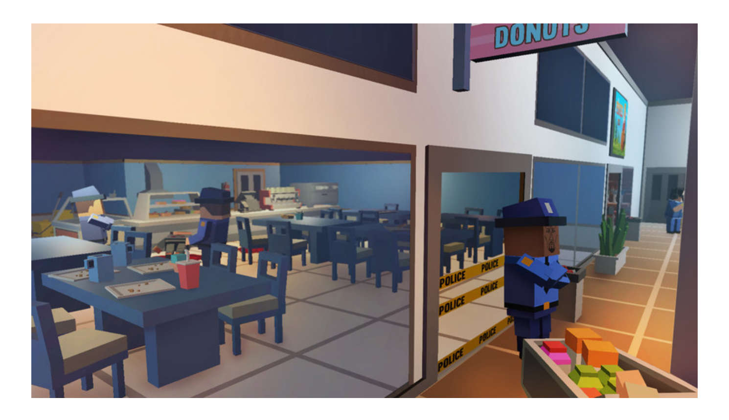
Download ->->-> <a href="http://bit.ly/2NUc1th">http://bit.ly/2NUc1th</a>

Crazy Oafish Ultra Blocks: Big Sale Download No Survey